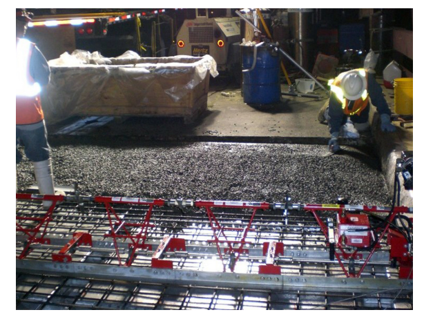
Mathews Bridge in Jacksonville, FL where lightweight concrete was used in conjunction with an Exodermic<sup>™</sup> deck to further reduce weight. The deck weighs less than 50 pounds per square foot while maintaining 2 inches of concrete cover over the rebar.

The use of lightweight concrete predates the Roman Empire period when local Grecian and Italian volcanic aggregates were used because of their availability, however strengths were limited by the quality of cementitious material. Some improvements were made to the strength of cement paste during the Roman Empire era, but it wasn't until 1824 when Joseph Aspdin developed Portland cement to provide a binder capable of exceeding the strength of lightweight aggregates of that time. The use of expanded shale, clay, and slate (ESCS) began around the turn of the 20th century but significant production and promotion was not seen until the U.S. involvement in World War I when reinforced lightweight concrete was favorably considered by the Federal Government as an alternative material for shipbuilding due to the shortage of plate steel. It is these ESCS aggregates manufactured today that produce the structural lightweight concrete which is 20 to 30 percent lighter than traditional normal weight concrete.