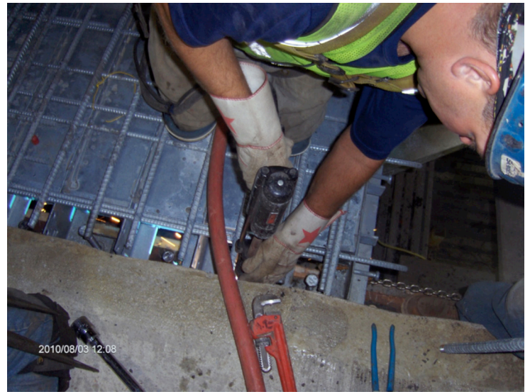
Figure 4 - Headed stud being field welded after panel placement.