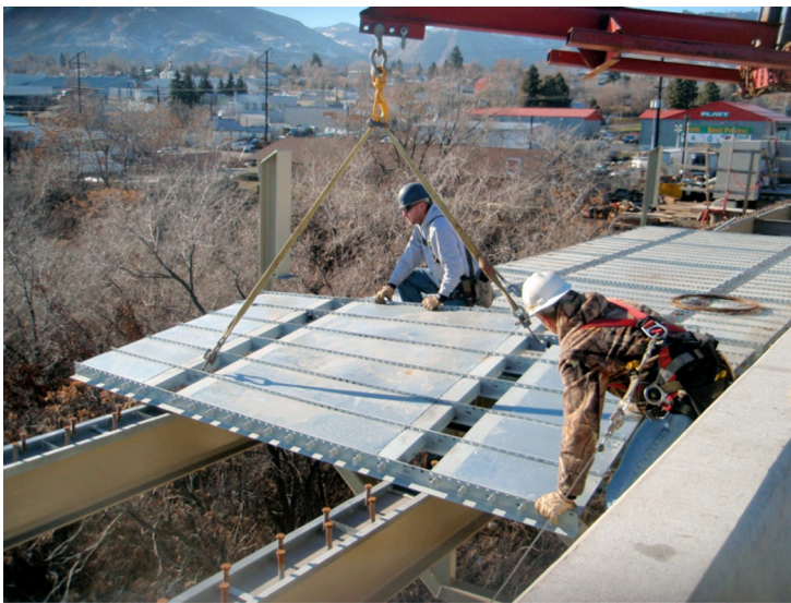
Figure 3 - Headed studs installed prior to panel placement.