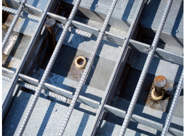
Figure 2 - Headed stud field installed showing desired full 360° flash prior to removal of ceramic ferrule.

Shear studs are attached using automated equipment. They may be welded to bridge girders either before or after grid panel placement. Welding before panel placement usually requires the Engineer’s approval and demands careful layout. If studs are placed after grid panels are erected, there is sufficient space between grid bars and/or rebar to insert the automatic welding equipment. Some more closely spaced grid designs do not allow the conventional stud bend test after they have been attached to the girders. In this situation, periodic weld equipment calibration and testing conducted on separate plates ensures weld quality. A separate welding generator is recommended to furnish power to each individual stud gun in order to assure acceptable welds. Finally, workmanship and techniques from various successful field installations of composite grid reinforced concrete bridge decks are shown in Figures 2 thru 4 .